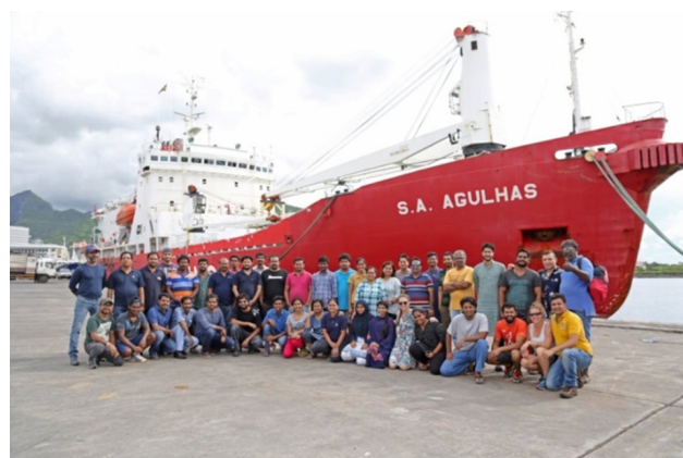
Team of 10 th Indian Southern Ocean Expedition