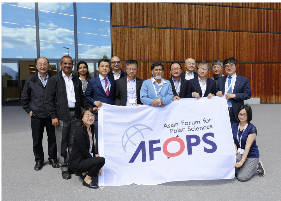
Group Photo for Participants on Davos's Meeting

The science forum of AGM was deeply discussed in the meeting, encouraged Asian member countries to develop international cooperation step by step in different regions such as logistics and Antarctic inland traversing in future.